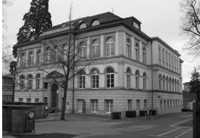
From 1909 to 1911, Albert Einstein researched and taught at the University of Zurich's former physics building at Rämistrasse 69.